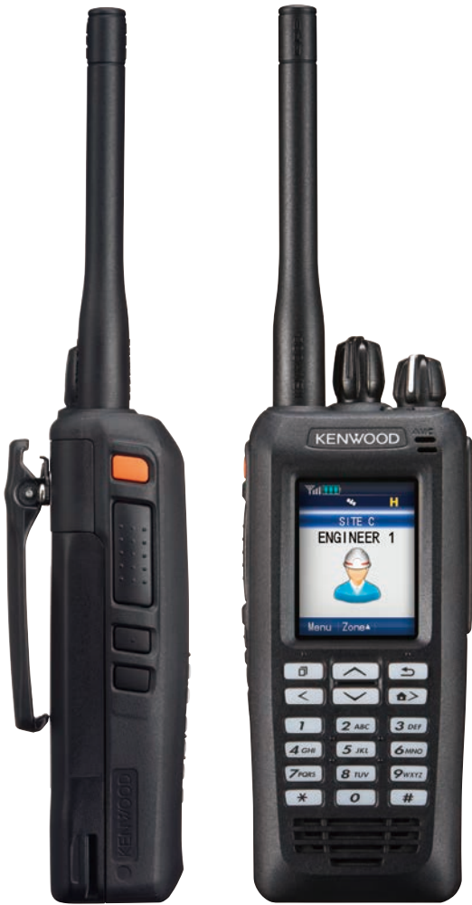
TK-D200(G)/D300(G) Display model