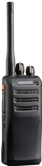
TK-D200(G)/D300(G) Non-keypad, non-Display model